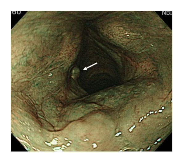
Figure 1-b: Endoscopic view of vocal fold granuloma. Granuloma visualized with Narrow Band Imaging (NBI)